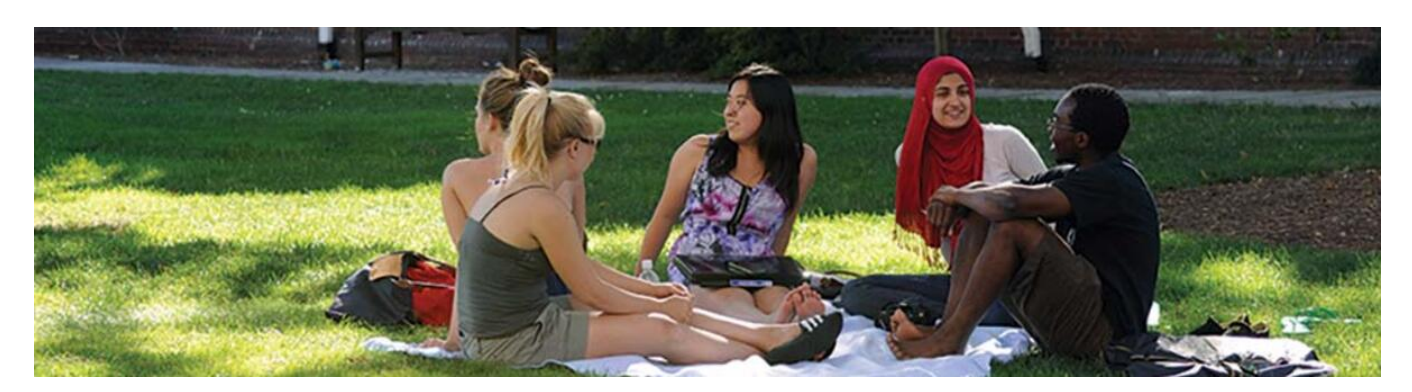
Hub Page View: